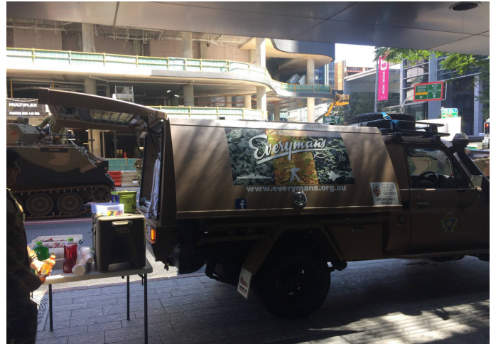
The Brew Truck at a more unusual venue during the recent Commonwealth Games on the Gold Coast