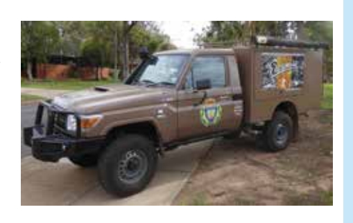
Above, the new Howell Swanton Trust Vehicle