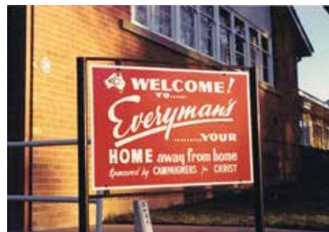
Below: One of our signs at Kapooka in the 80's