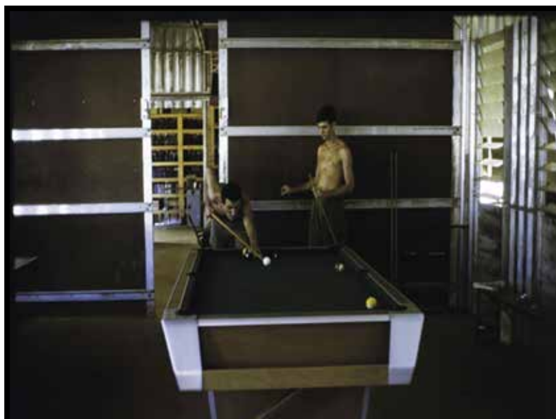
1960-1975 AT 1ST AUSTRALIAN TASK FORCE (1ATF) BASE AT NUI DAT Two unidentified soldiers, probably from 2RAR/NZ, playing snooker on a billard table inside the building operated by the Everyman's Welfare Service (EWS) as a recreational facility for troops