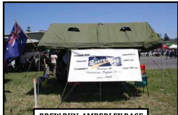
BREW RUN AMBERLEY BASE

OUR EVERYMANS 'BREW RUNS'... OUR DIGGERS JUST LOVE US! OUR BREW TRUCKS ARE THE EVERYMAN'S FLAG SHIPS