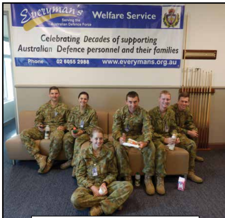
BANDIANA BASE EVERYMAN'S RECREATION CENTRE