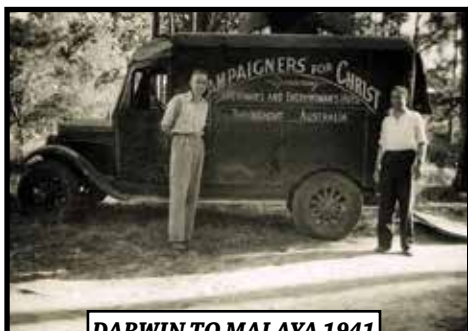
DARWIN TO MALAYA 1941