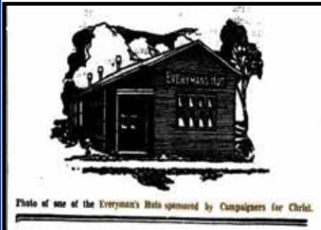
Photo of one of the Everyman's Huts sponsored by Campaigners for Christ.