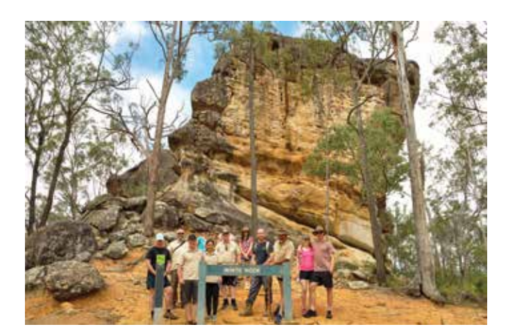
Group shot at White Rock

For those in Brisbane check out Bare Knuckles BBQ, you won't be disappointed! Current serving and Veterans get a discount! (617 Toohey Rd, Salisbury)!