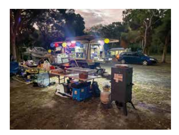
Camp setup with one of the Brewtrucks