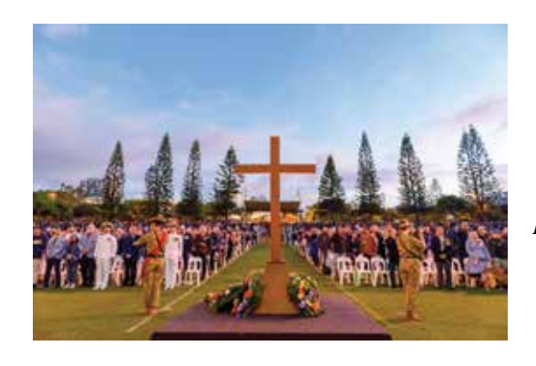
Left: Caloundra Dawn Service