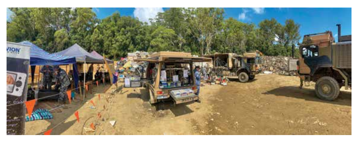
REP Brad Clarke serving at the rubbish dump