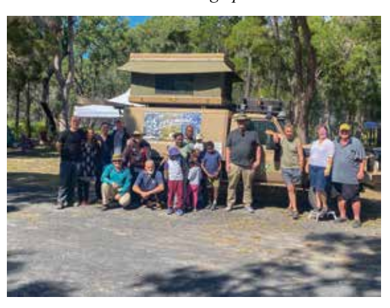
Some of the participants at the EveryVets Easter Family Camp