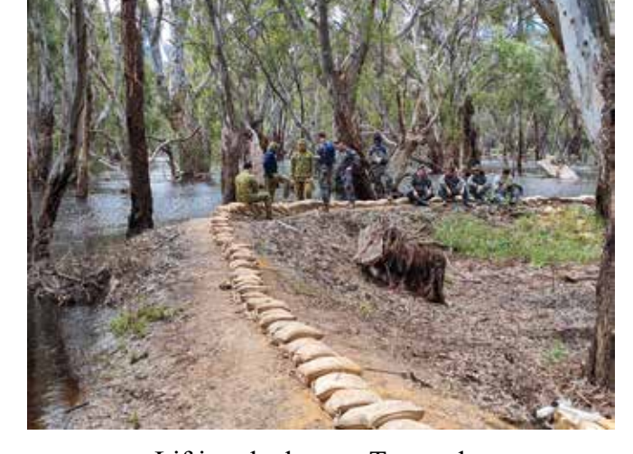
Fresh bags and new start at Tytynder