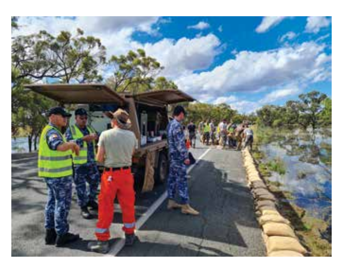
Keeping the Murray Valley highway open at Pianga

So many of our readers and supporters will have been affected by the floods that have extended across NSW and Victoria, and if not directly impacted by them, you will most certainly have been following the devastating and widespread effects of them on the news.