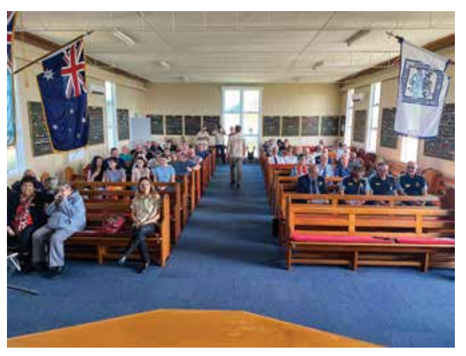
The beautiful chapel at Wacol being put to good use once again