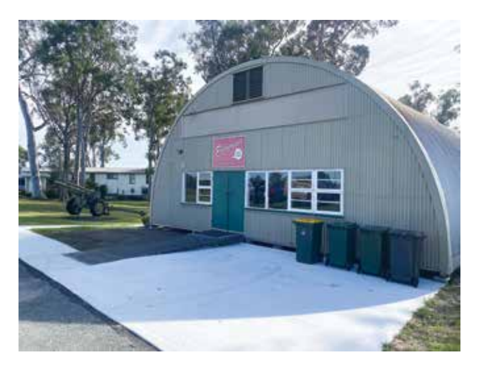
Wacol with new historical sign