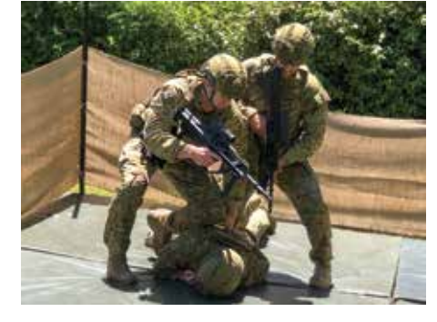
Defence Recruitment Expo Casula Powerhouse