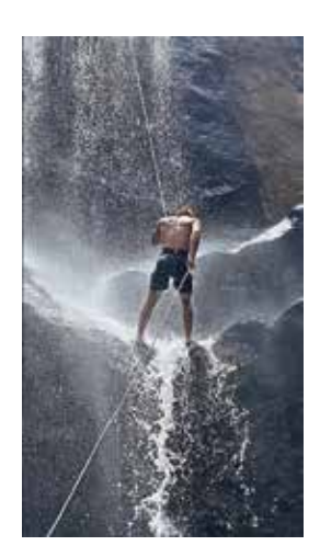
Climbing & Abseiling at Robin Falls NT